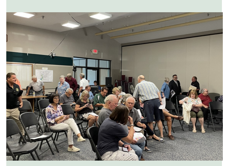
The crowd from one of 2022's well-attended public workshops.